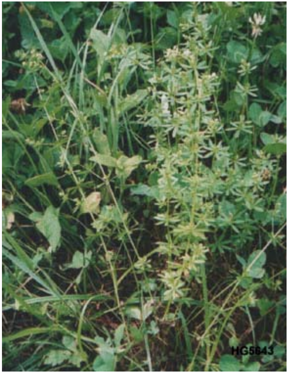
Galium species