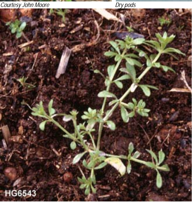
Largest plant on July 1. Top left has Sherardia seedling.