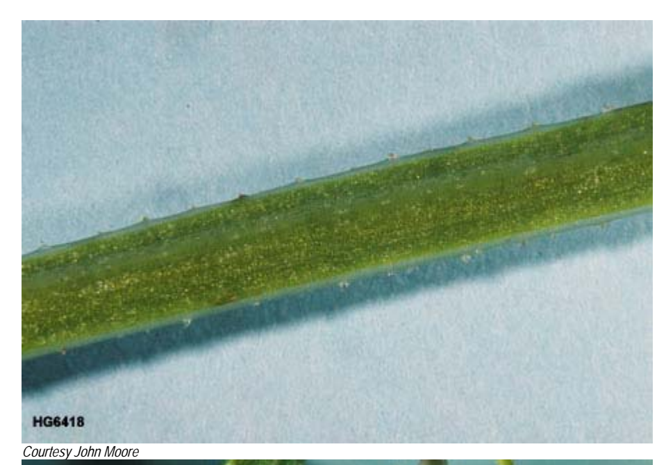
Leaf showing backward and forward pointing prickles.