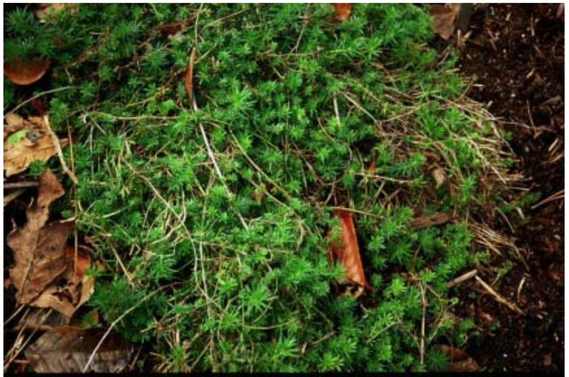
Lady's Bedstraw (Galium verum) Tasmania, October.