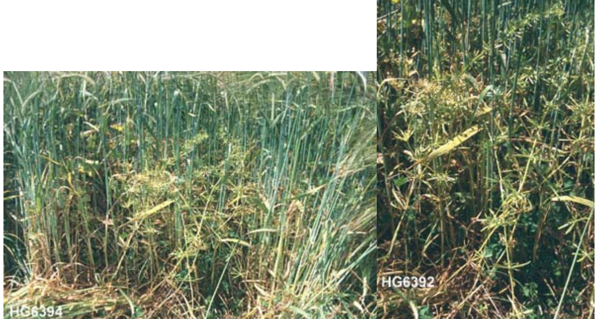
November in Barley