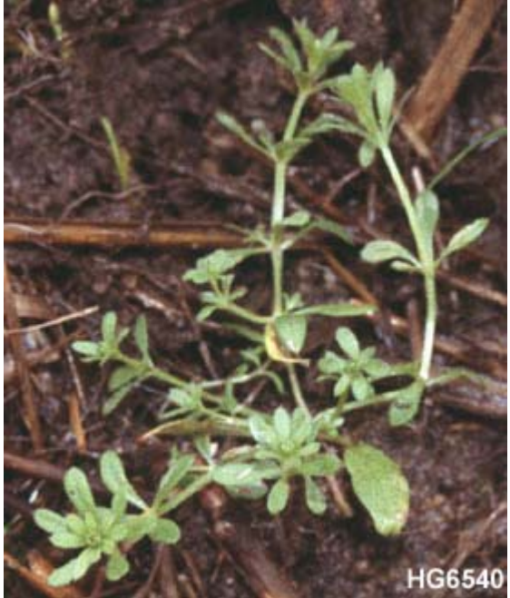
July 1. Note large cotyledon on bottom right.

Three-horned Bedstraw seedling with surrounding Field Madder (Sherardia arvensis).