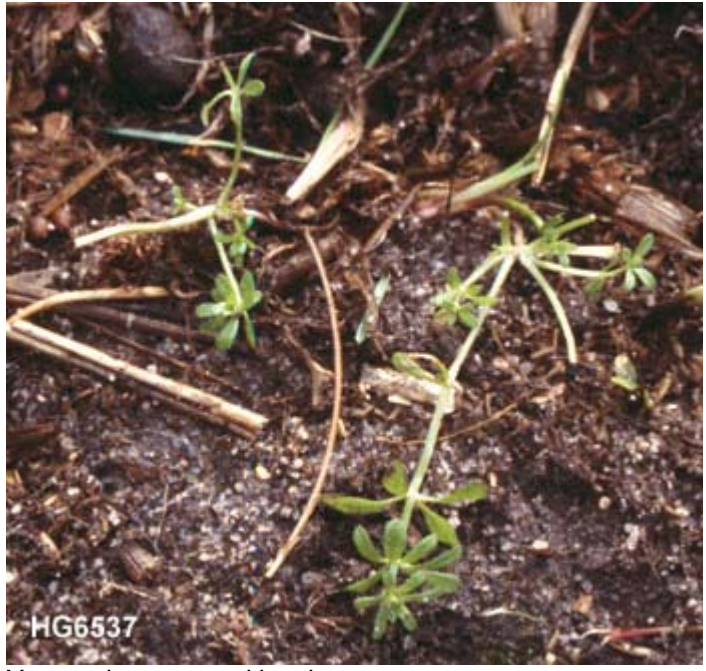
Young plants grazed by sheep.