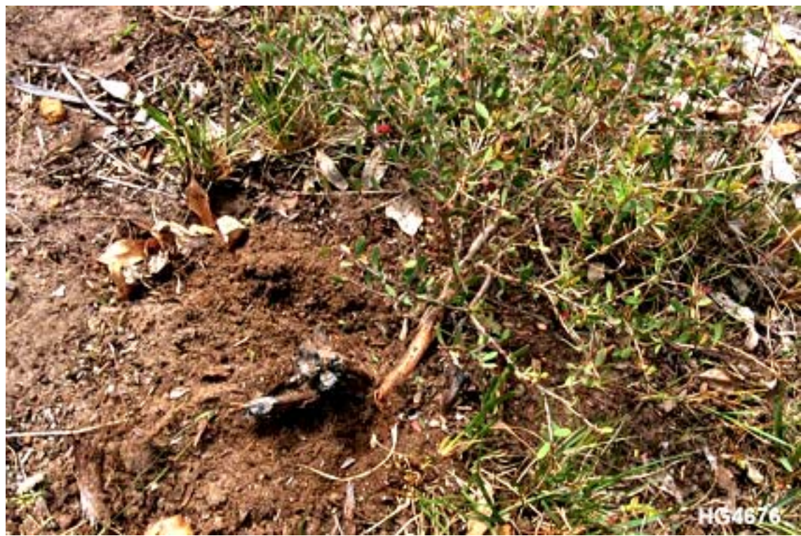
Small cut plants regrow.