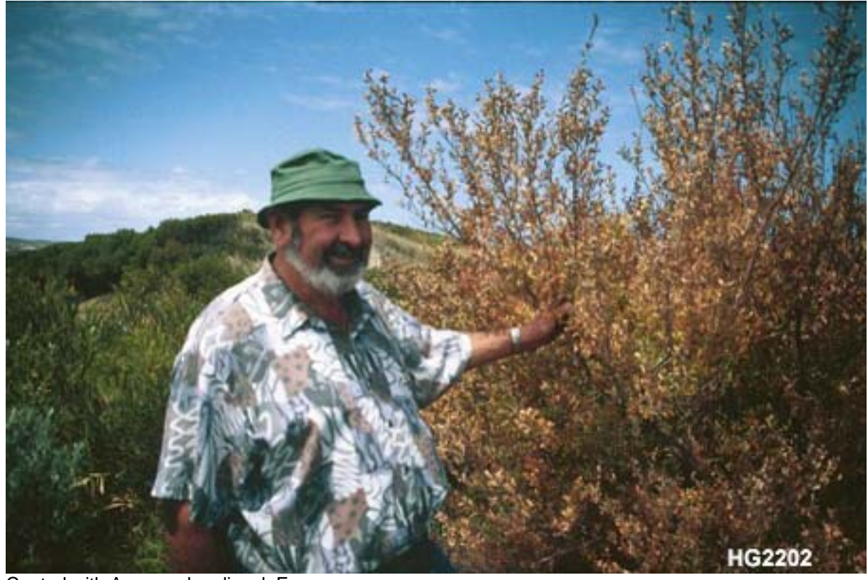
Control with Access plus diesel, Esperance.