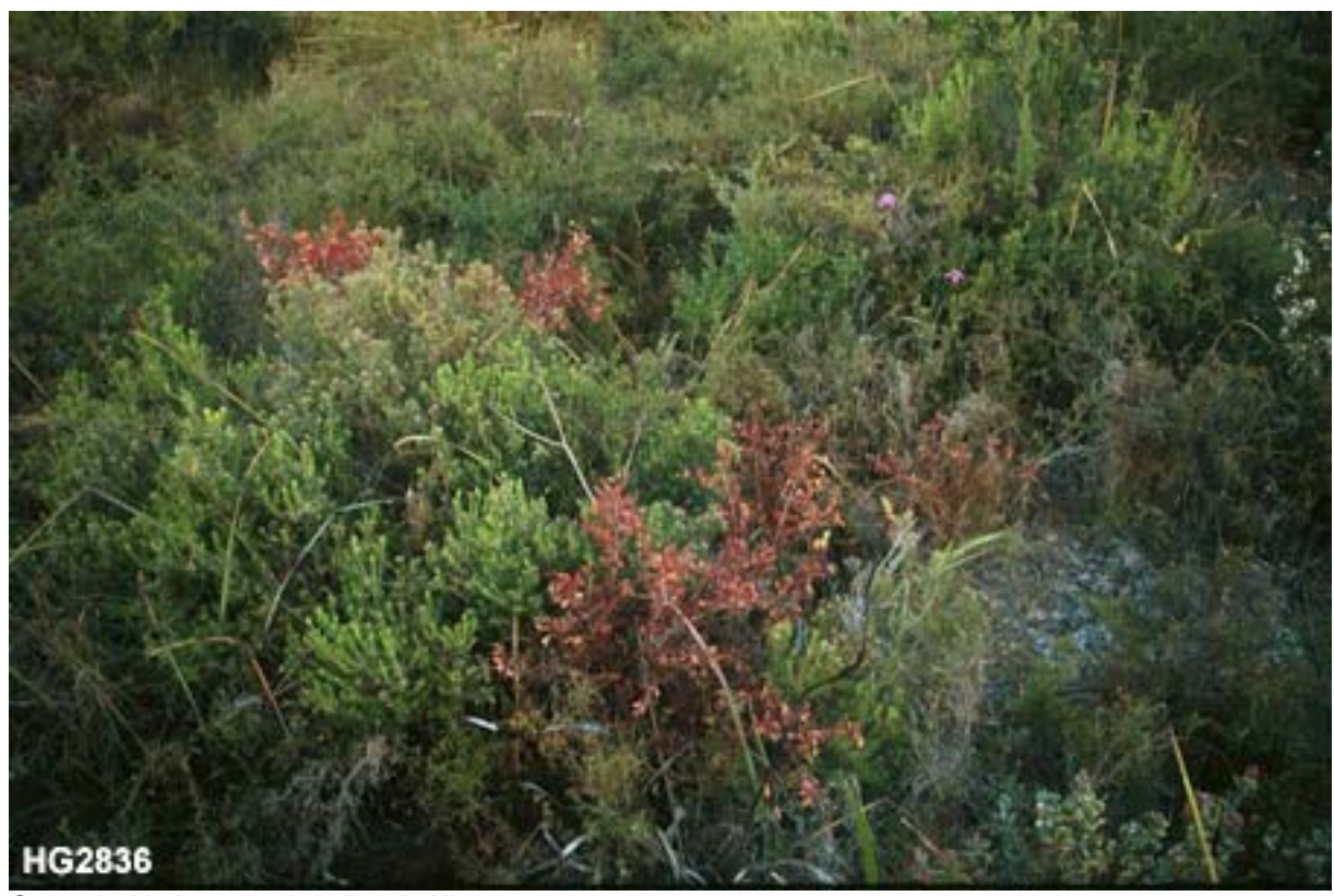
Control with Access plus diesel, Albany. Courtesy John Moore