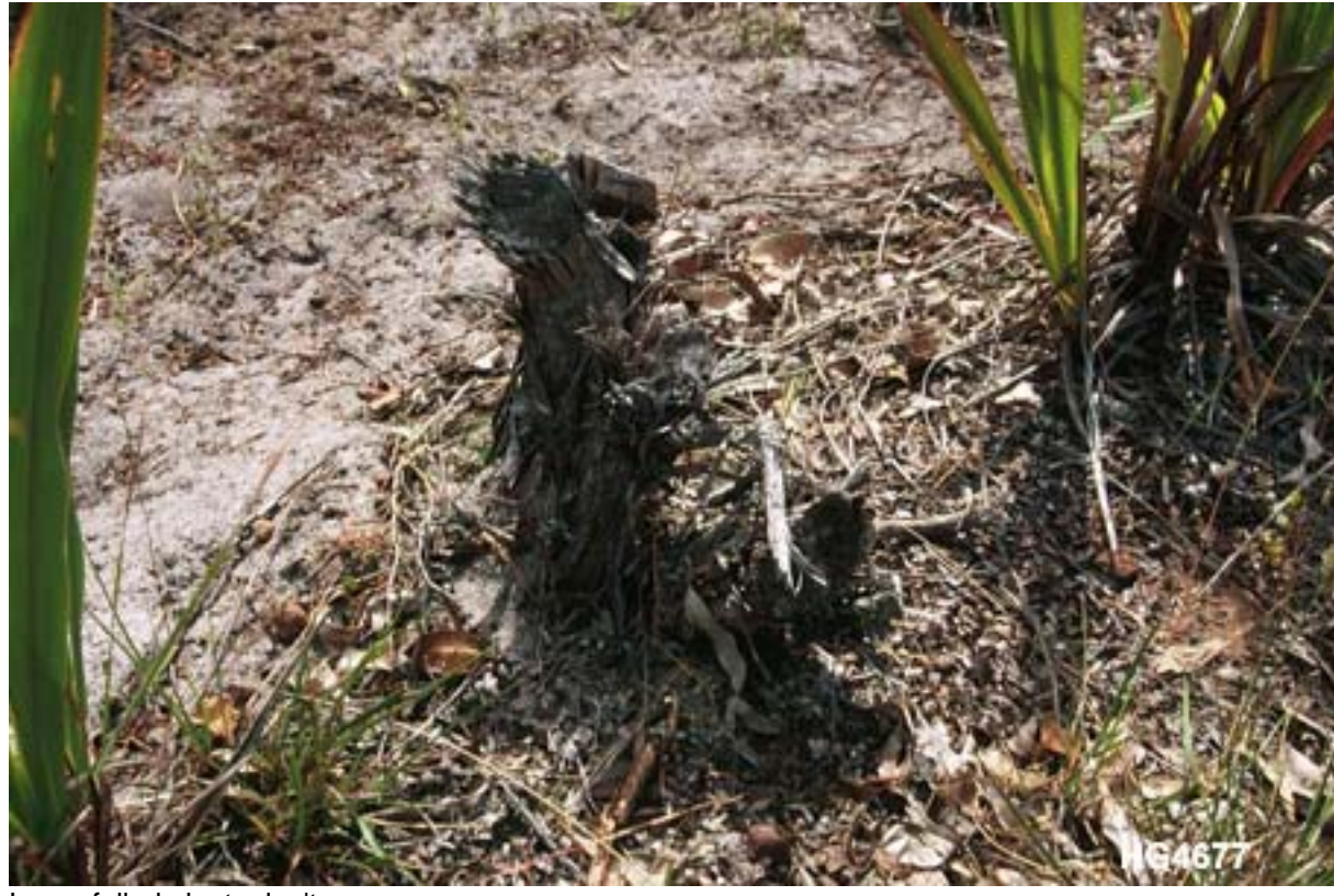
Large felled plants don't regrow.