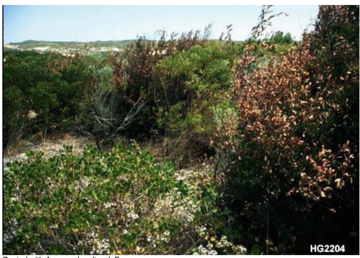
Control with Access plus diesel, Esperance.