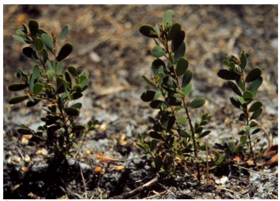
Seedlings