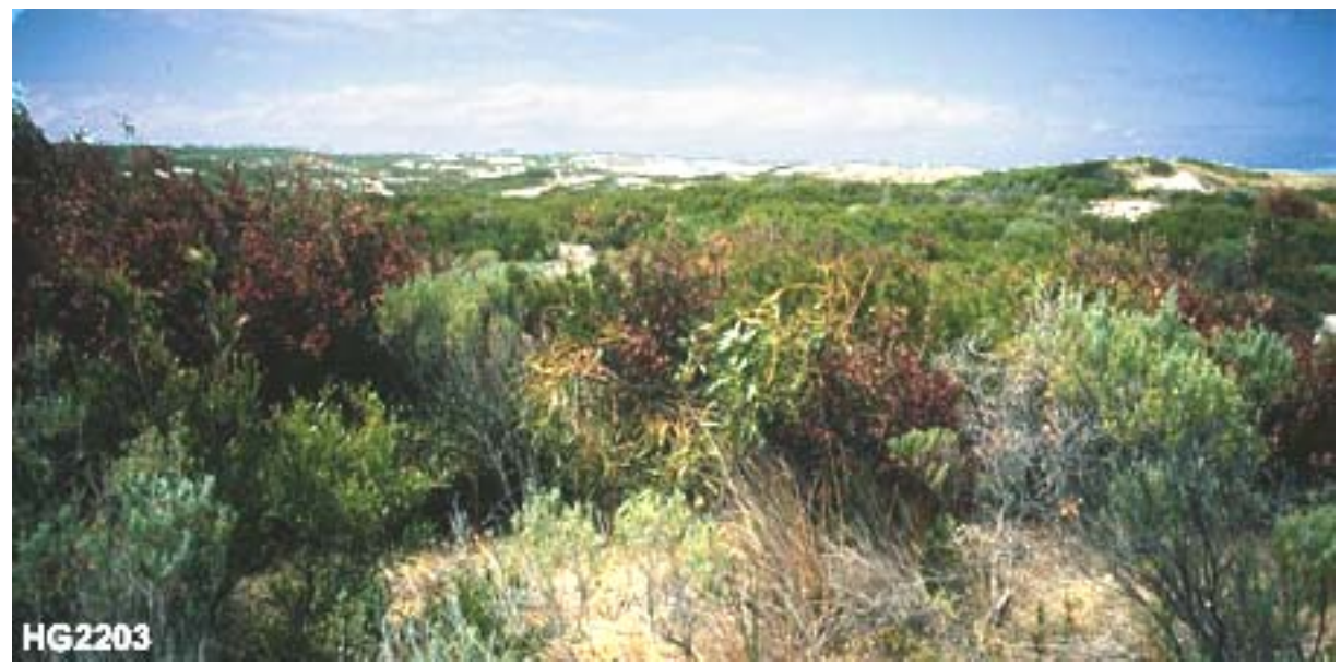
Control with Access plus diesel, Esperance.