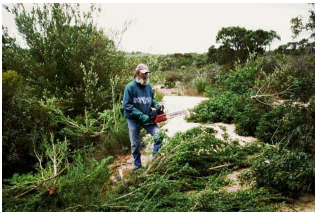
Felling provides effective control of large bushes but not small ones, Albany.