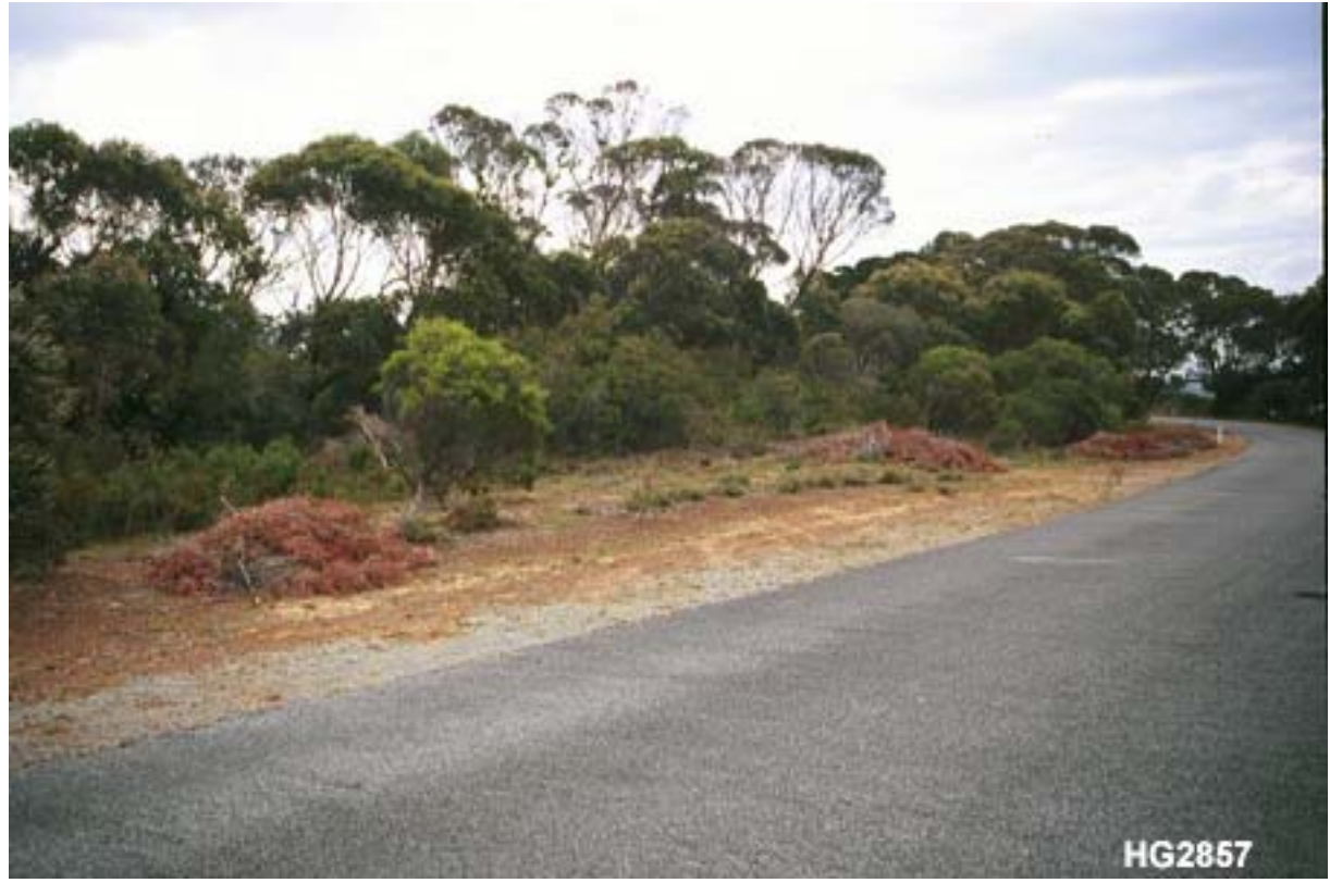
Parry Beach, hand weed and fell. 10 man hours.