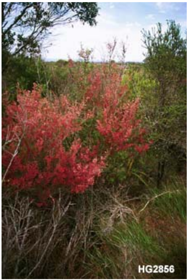
Control with Access plus diesel, Parry Beach.