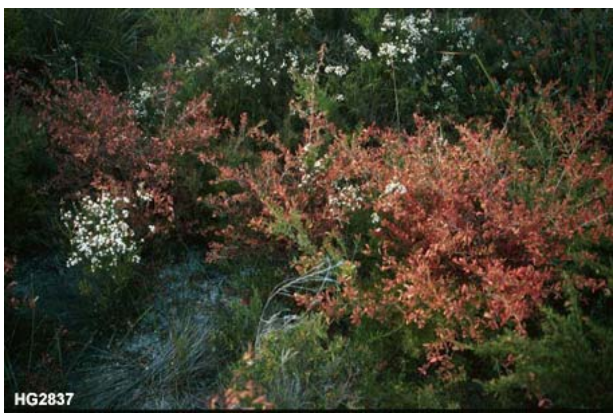
Control with Access plus diesel, Albany.