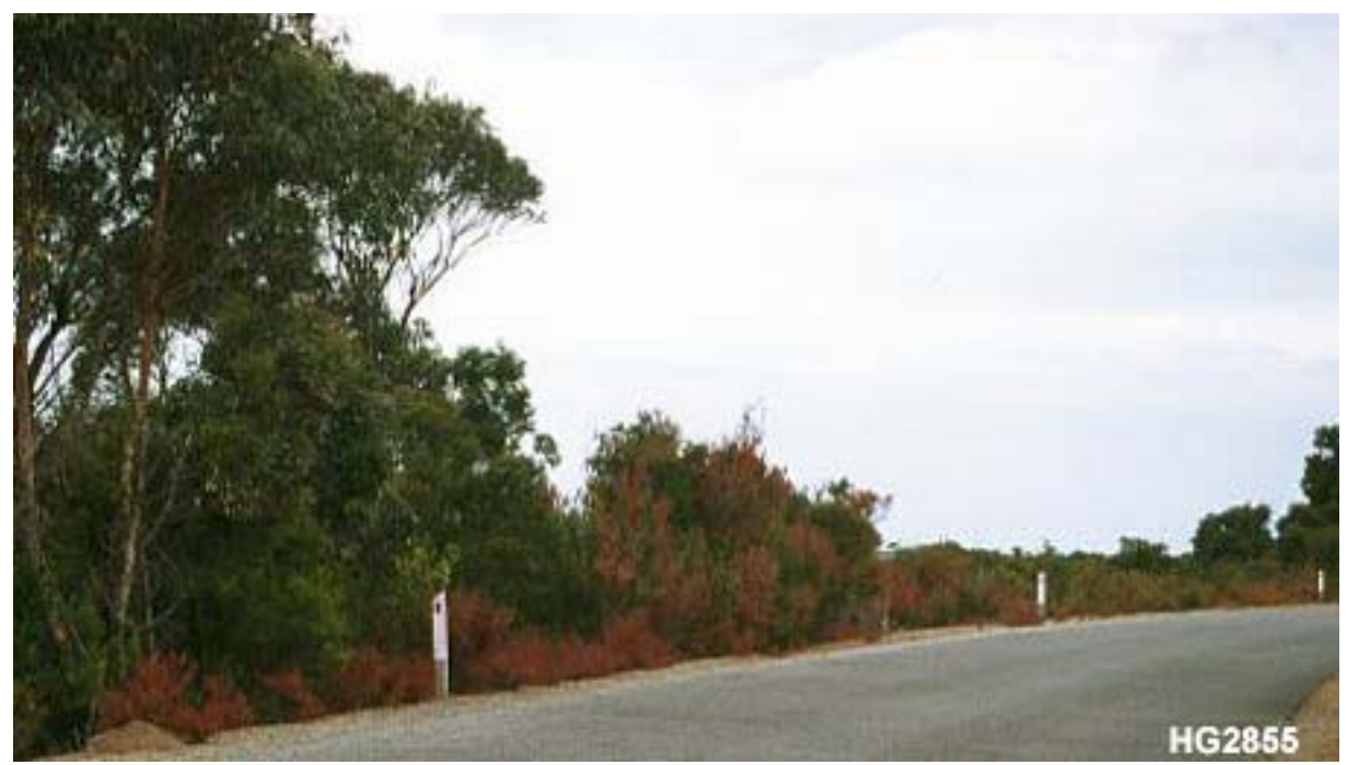
Parry Beach, Access plus diesel in foreground, glyphosate in background. 1 man hour.