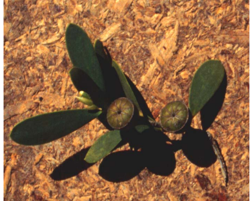
Fruit