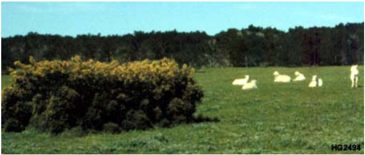
Goats may contain Gorse.