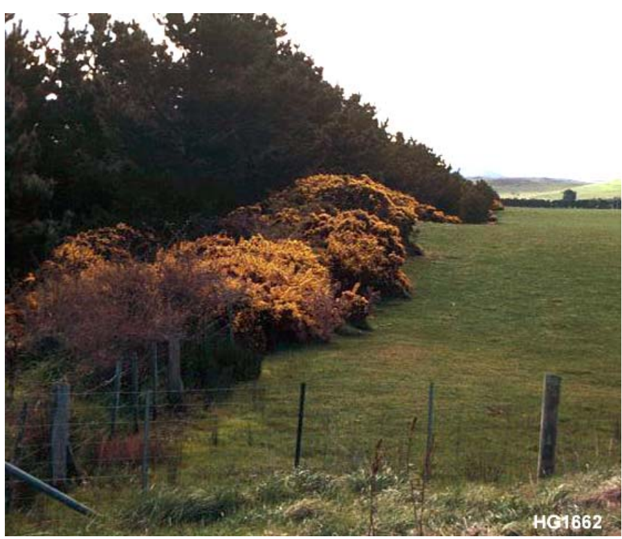
Gorse was used as a hedgerow plant.