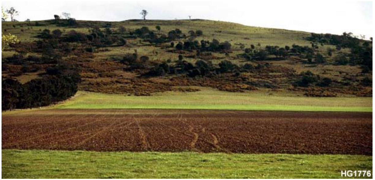
Gorse tends to dominate on neglected areas.