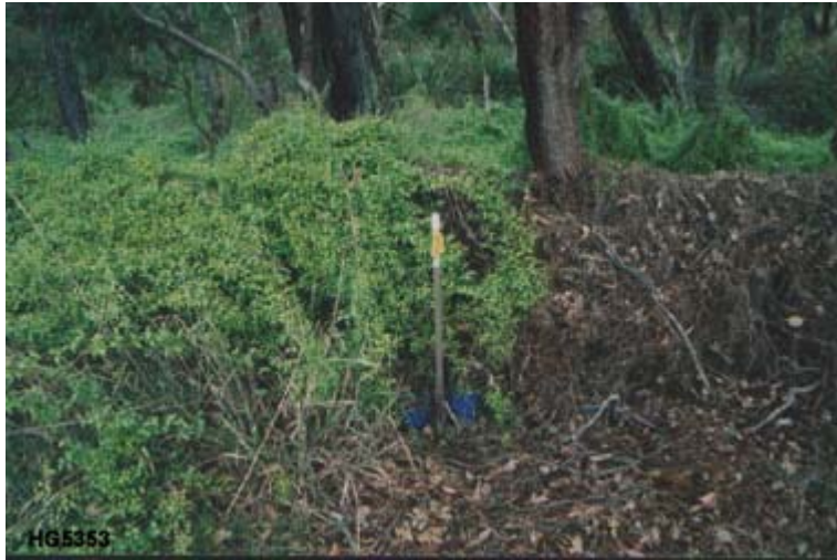
2 g/ha Metsulfuron on right, Leafhopper on left of peg.