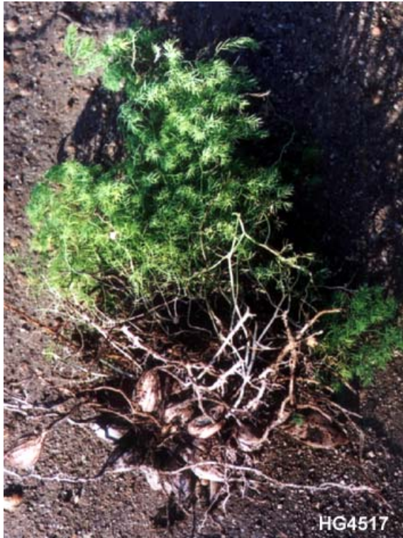
Asparagus crispus