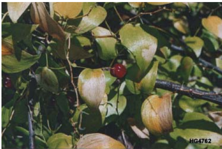
Leafhopper damage