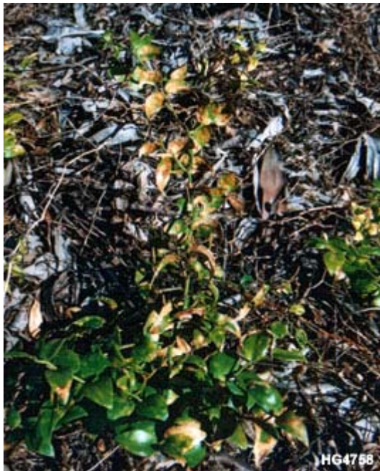
Plant with biocontrol Rust Courtesy John Moore