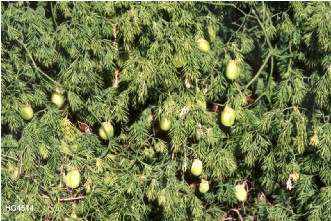
Asparagus crispus