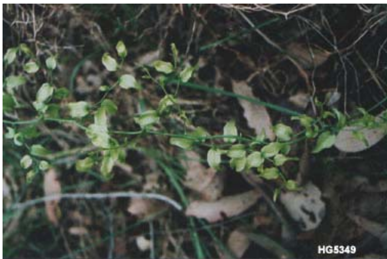
Metsulfuron symptom on surviving Bridal Creeper.