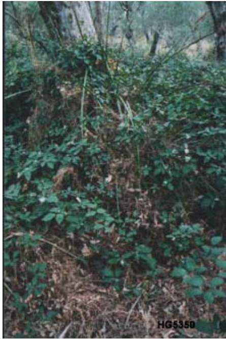
At 2 g/ha metsulfuron Bridal Creeper dies and Blackberry and other species are not affected.