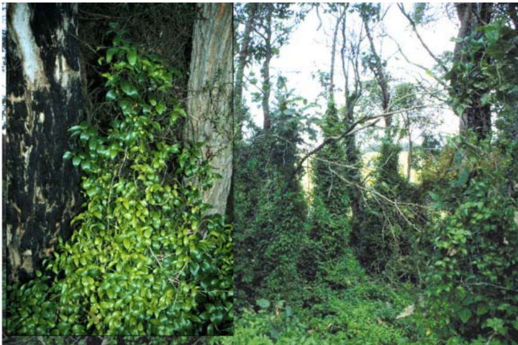
Bridal creeper Asparagus asparagoides

Asparagus asparagoides Asparagaceae family