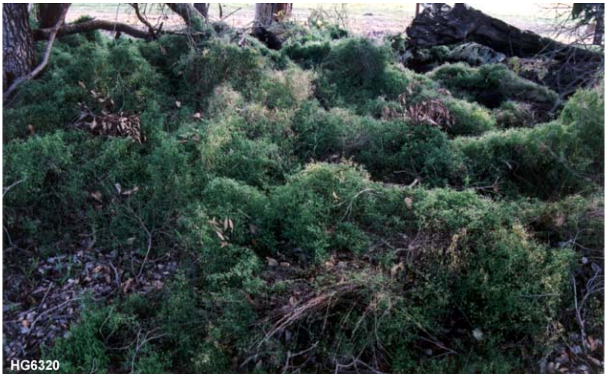
HG6320 Asparagus crispus