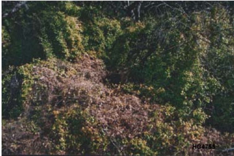
Sward affected by biocontrol Rust and Leafhoppers