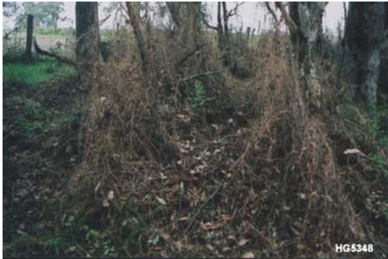
2 g/ha mesulfuron applied with a backpack mister.