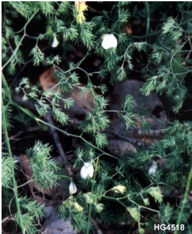
Asparagus crispus plant with Spit Bugs