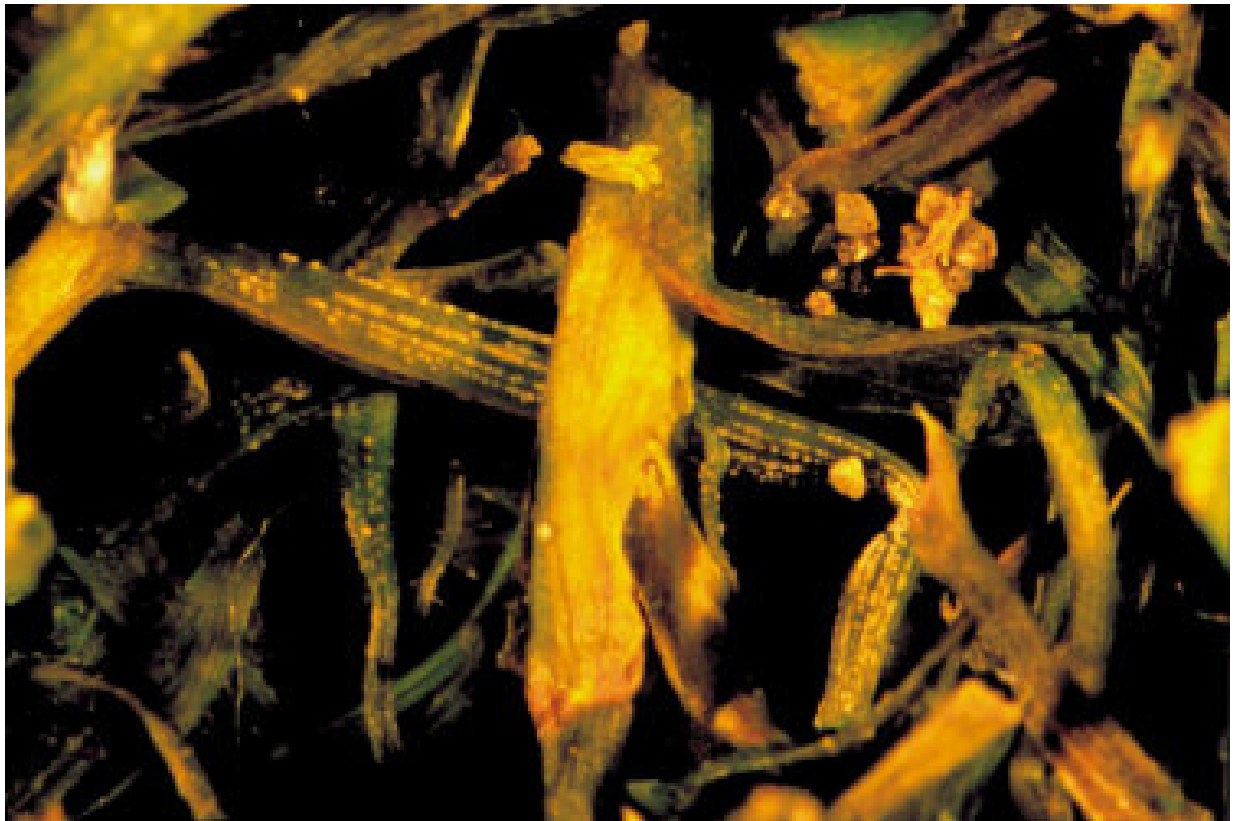
Spore laden leaves. Note spores emerging from stomata.